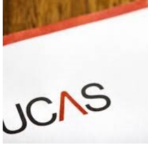
UCAS- Managing Your Offers